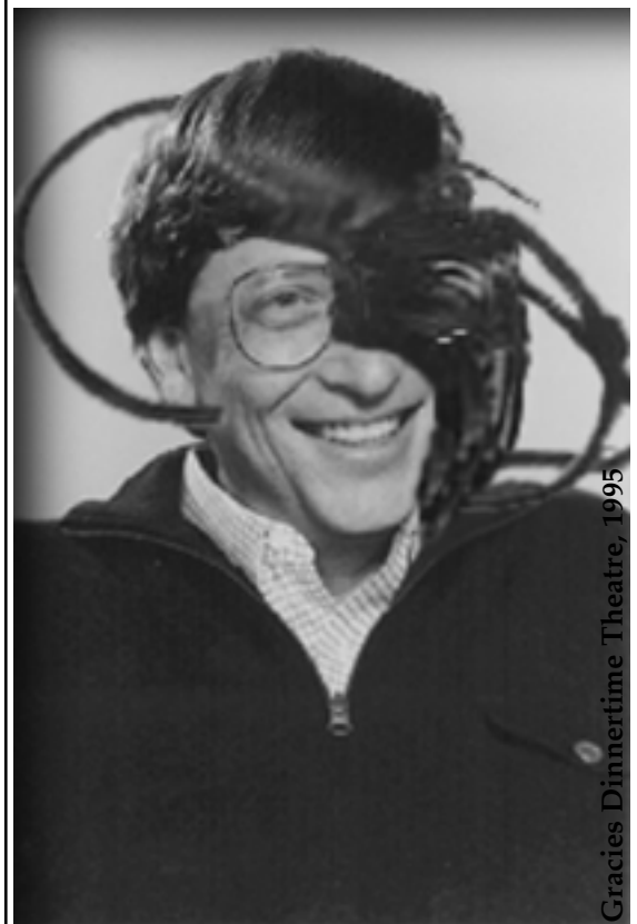
Gracies Dinnertime Theatre, 1995

WE ARE MICROSOFT. OS/2 IS IRRELEVANT. UNIX IS IRRELEVANT. OPENNESS IS FUTILE. PREPARE TO BE ASSIMILATED.