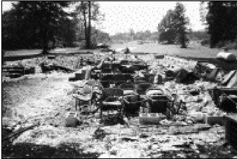
An example of "the Seven Dwarf's" handiwork

For those religiously successful travelers who manage to pass through the desert, drinking the blood and urine of their fallen comrades, they will have to face Southern California and all of San Francisco's glory that is gay pride. There, thousands of Gay and Lesbian militiamen, trained by the newly released and reprogrammed Pirates of the Caribbean, will beat and enslave the dehydrated Baptists. The Baptist females will then be used as sex slaves by dominatrix lesbians, while the baptist males are not allowed to watch (now that's torture!). After being satisfied, the Baptists, filled with confusing sexual longings, will be driven to the sea and forced to clean up crude oil spills, pick up hypodermic needles, and constantly take water purity readings of water that is obviously contaminated with human wastes.