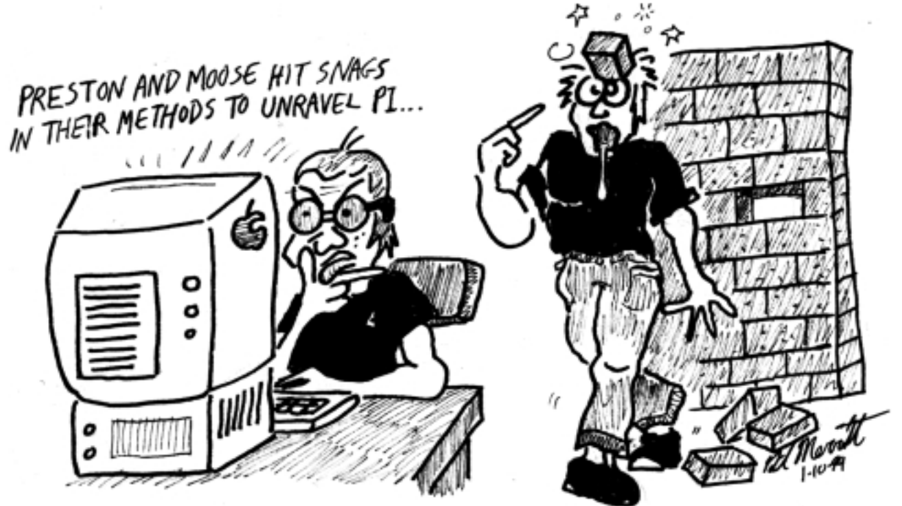
Free and Accepted Masonometry

Canadian : a person who vacations in Cuba.