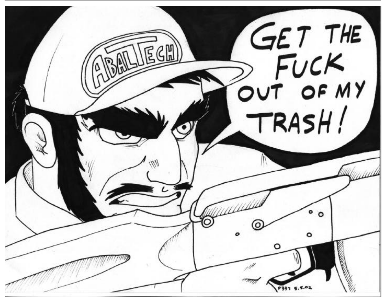
The Custodian Conspiracy By Rocko Bonaparte

Outside AbalTech's Building B, a bunch of old, bustedup cars congregated in the parking lot. The sun had set, but the day had just begun for the janitors. They mopped the floors in the cafeteria, they emptied the garbage in the cubicles, and they made sure everything would be clean come tomorrow. It took them about an hour from start to finish. Then the real fun began.