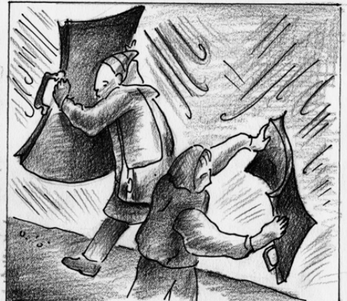
And don't Forget the breathtaking Wind Surfing Spectacle!