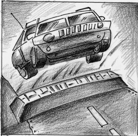
Enjoy our Improved Stunt Driving Course.

IN Rochester THERE is only one place for all your outdoor entertainment needs: RIT